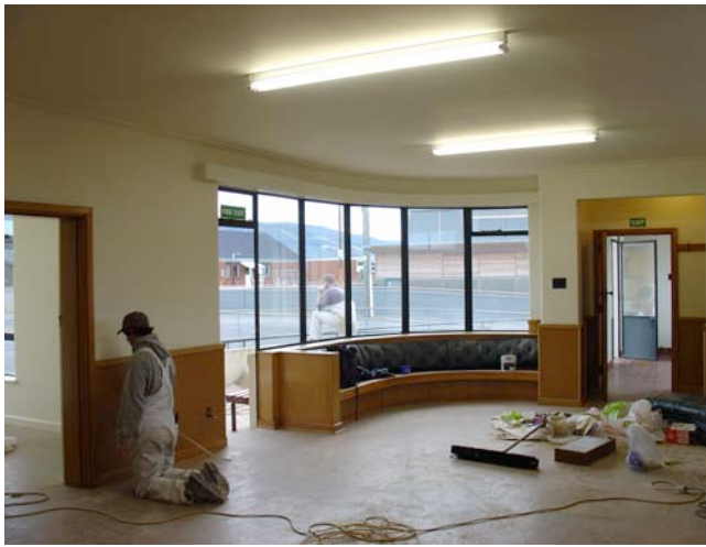
Work in progress in the former Plunket Rooms