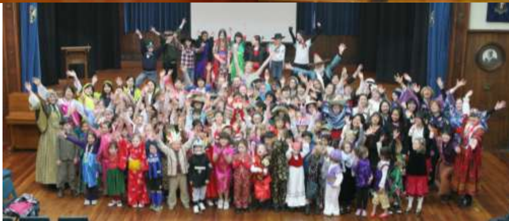
Monday and Thursday assemblies and International Mufti morning