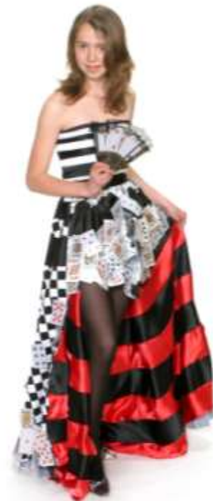
1st Place Years 9 and 10 "Card Game Queen"